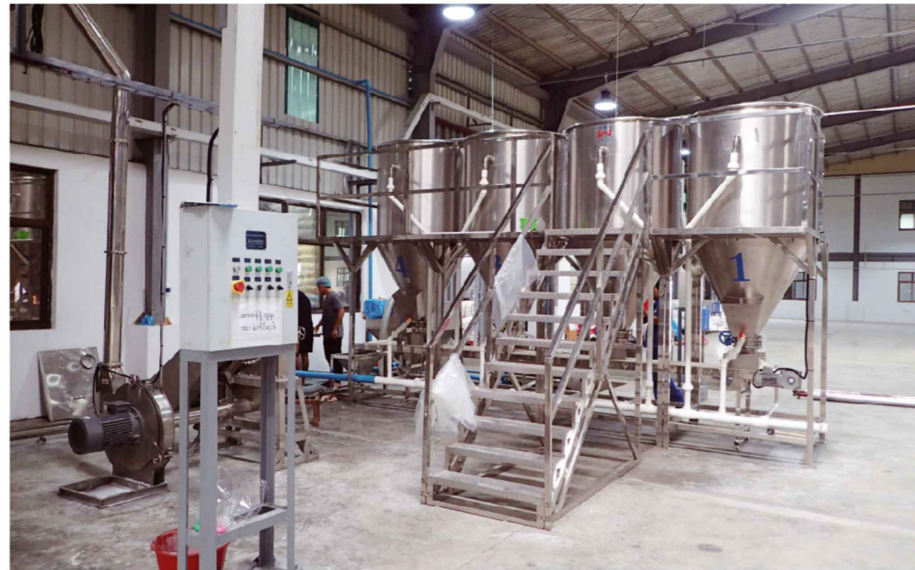
Rice Water Absorption System 大米吸水系统