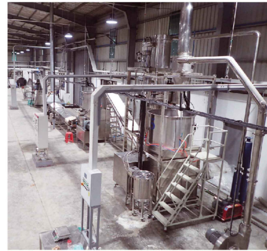
Double Steaming Rice Vermicelli Production Line 二次蒸煮米粉生产线全景

Adhering to ISO standards, we provide full-cycle support— from pre-sales consultation to after-sales care. 严格遵循 ISO 标准体系，提供从售前咨询到售后维护的全周期服务保障。