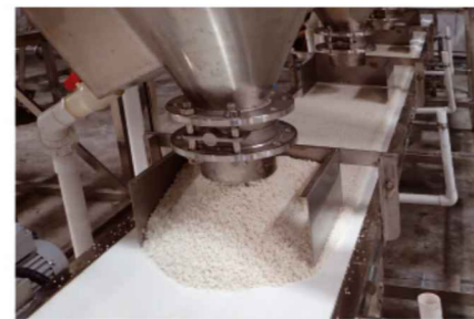
Rice & Water Separator 水米分离器