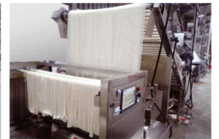
Cutting and Putting-up Device 切断起挂机