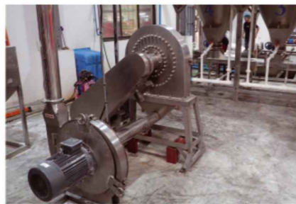
Rice Grinding System 大米粉碎系统