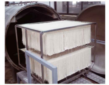
High Pressure Steamer 高压蒸锅