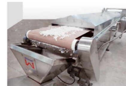
Rice Pellet Steamer 蒸粉粒机