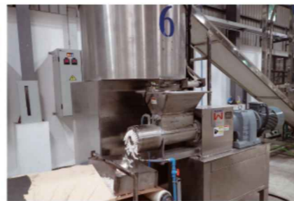
Rice Noodle Pelletizing Extruder 大米粉挤粒机