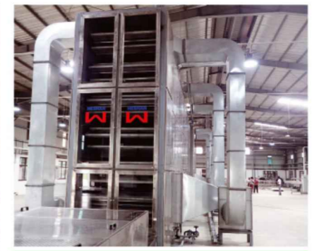
Hanging Basket Dryer 粉丝烘干机